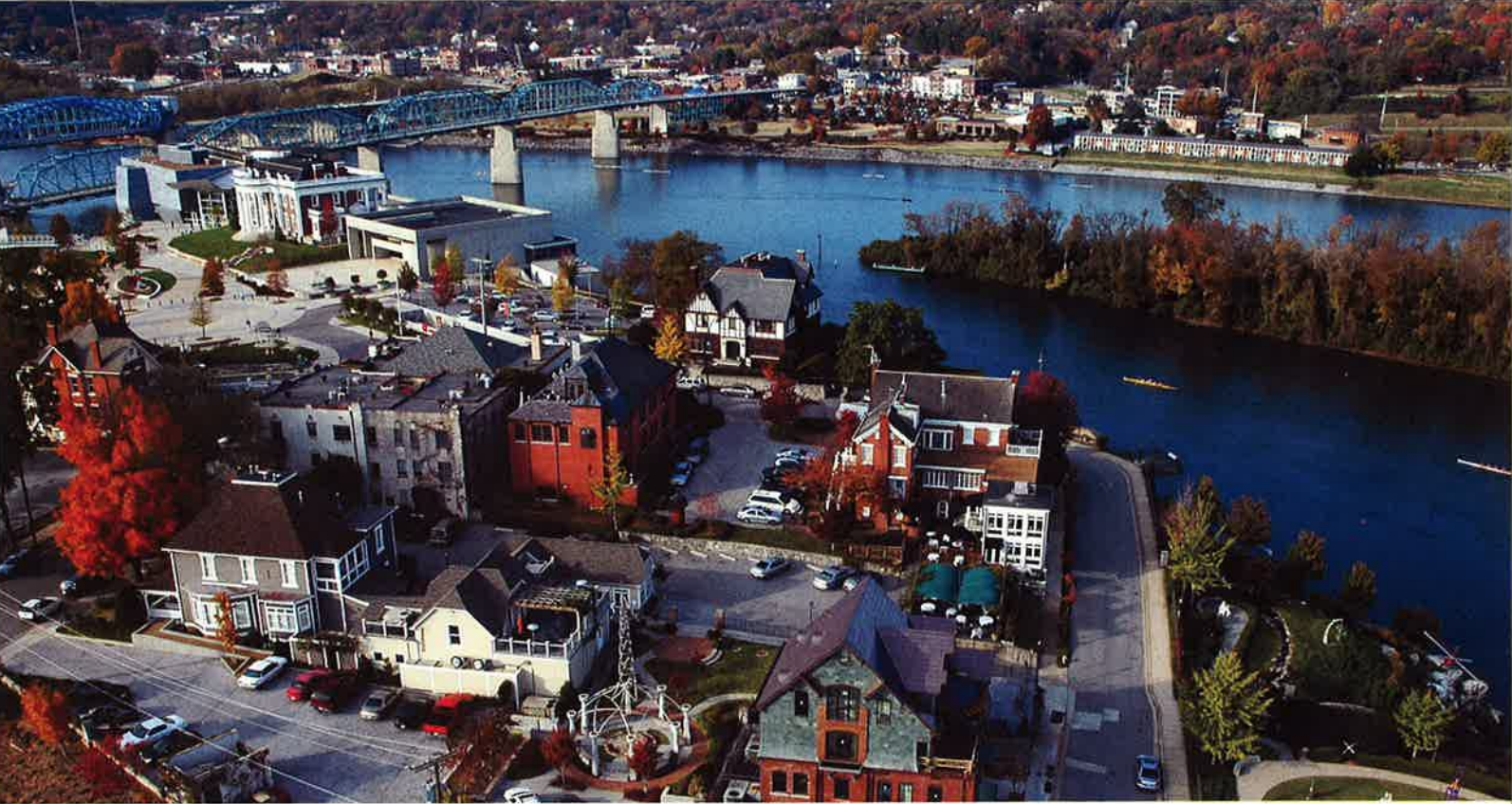
Aerial view of Chattanooga's Bluff View Art District